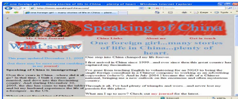
Figure 2. The title banner of “Speaking of China”. Reproduced with permission.