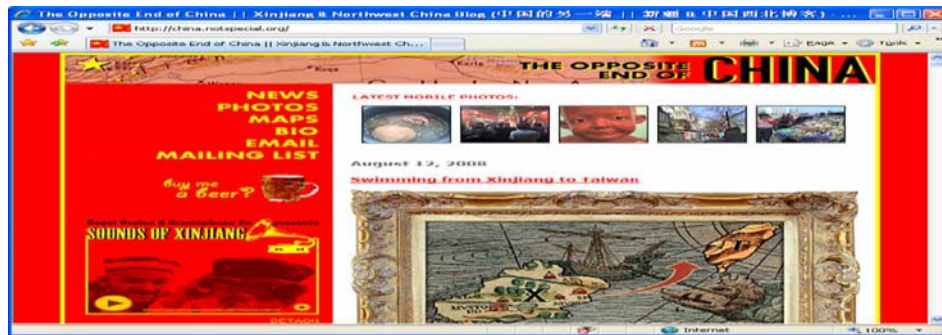
Figure 1. The title banner of “The Opposite End of China”. Reproduced with permission.