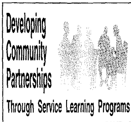
Community Partnerships — Page 27

Educ LIB 3623 .007 1136 May 1993 111 111