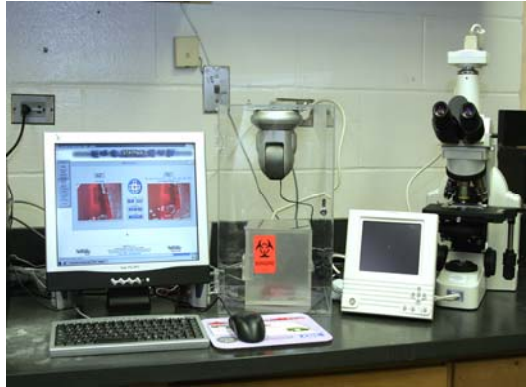
Figure 1. STATPack Hardware