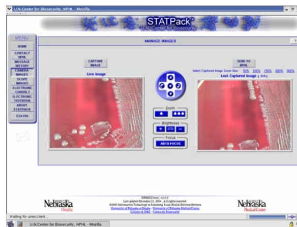
Figure 2. STATPack Capturing Image