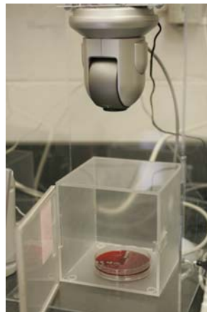
Figure 3. STATPack Biosafe Specimen Container

One other notable requirement was the need to design an airtight biosafe container that could house potentially biohazardous specimens and the digital camera. The system analysts worked with local plastic specialists to design a small biosafe container, as shown in Figure 3.