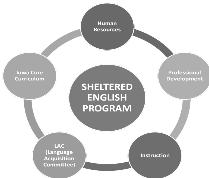
Figure 2. A visual model to represent the elements needed to be developed in order to successfully implement a program model for serving the language needs of ELL students in low incidence schools. Developed by Mary R. Smith, 2010.