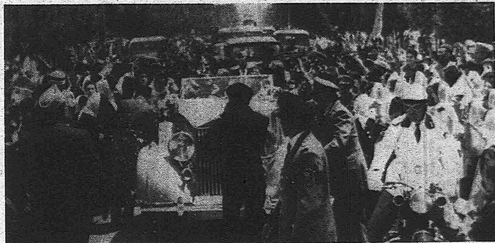
His Majesty acknowledging the greetings of the cheering crowds when he drove from the Kandahar airport to the city on Thursday.