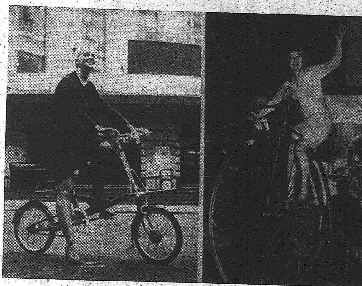
New styles of cycles exhibited at the International Cycle and Motor Cycle Show in London's Earls Court recently.

It has also been found that a greater weight of fruit is picked in the same time from smaller trees, not only because there is less ladder work, but also because smaller trees tend to give bigger individual apples. But as height increases, production falls until with a tree 24 feet (7.3 metres) high some 30 per cent of the fruit picker's total ladders.