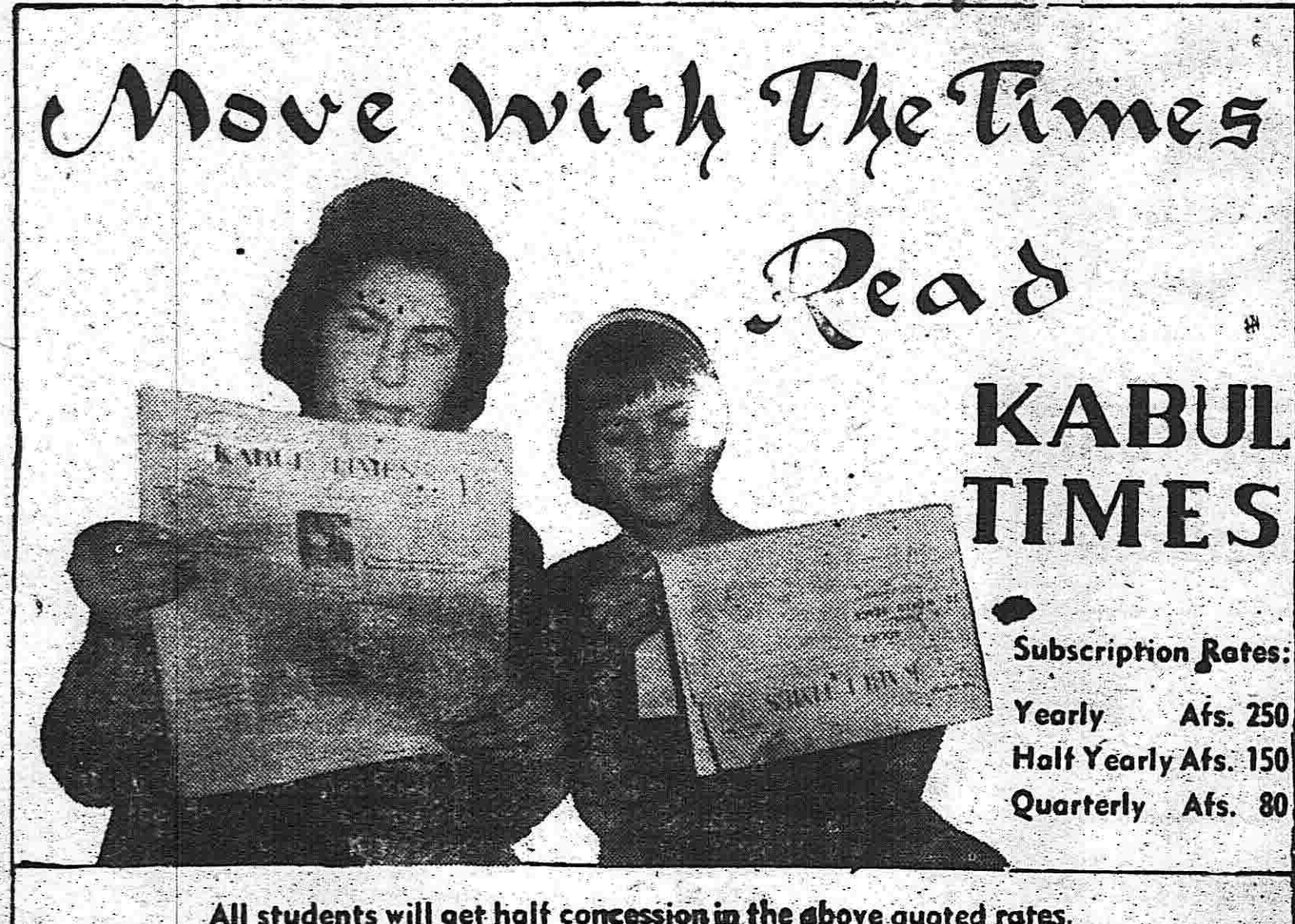
All students will get half concession in the above quoted rates.

BELEM, (Brazil), Feb. 23, (Reuter).-The nine Venezuelans who hijacked the freighter Anzoategui arrived here last evening. The Brazilian authorities handed over the 3,127-ton freighter to her owners and Venezuelan Embassy representatives on Thursday. The men who seized her in the Caribfirst hours of war. Therefore, Press Syndicate announced after Livingston Merchant, President interned at a naval hospital in a