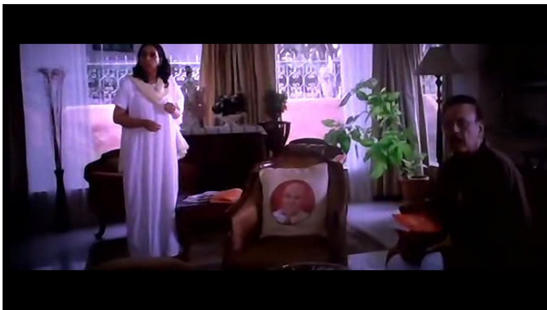
Figure 2: Jaggu's parents are introduced. Cushion cover can be seen carrying photograph of Tapaswi.