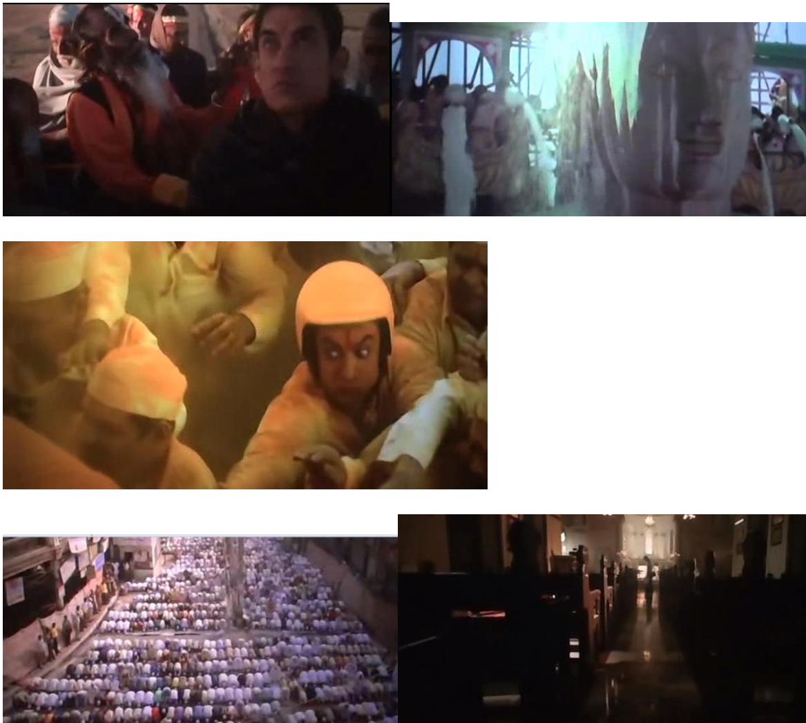
Figure 4: Snapshots from the song 'Bhagwan hai kahan re tu'

This paradox is constructed through a song, which has been written to forward the story of the film. It establishes his struggle to search for his creator, who could help him go back to his home. The depiction of various religious practices followed in Hinduism, Sikhism, Islam, Christianity, Jainism, etc. is blended with the lyrics and theme of the song.