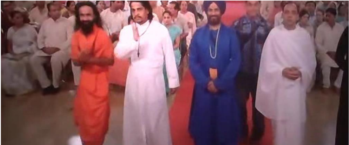
Figure 5: A snapshot of the scene, where PK tries to minimize differences between different faiths.

PK by now has declared a war against fake Godmen and managers of religions, who divide people. His TV show asks people to expose such Godmen from all religions. He says that they use fear of people for establishing their business of religion and acting as representatives of god on earth, and demonstrates this by doing the same using a stone as an idol and it works.