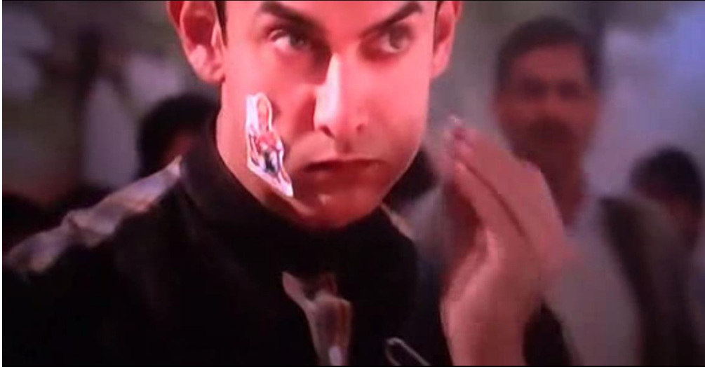
Figure 3: PK pastes pictures of God to avoid being hit.

PK starts narrating his tale to Jaggu, who keeps inquiring about why he appears different from others and we see a flashback into the past. In one of the scenes, he is told that an idol of god listens to prayers to which PK says, does God not listen directly? He is sent to a temple in which a huge deity is placed. Thereafter, realizing that the charity he offered was not reciprocated, PK goes to the police to complain against God. This is similar to Oh My God (2012), in which the protagonist (Paresh Rawal) files a law suit against God.