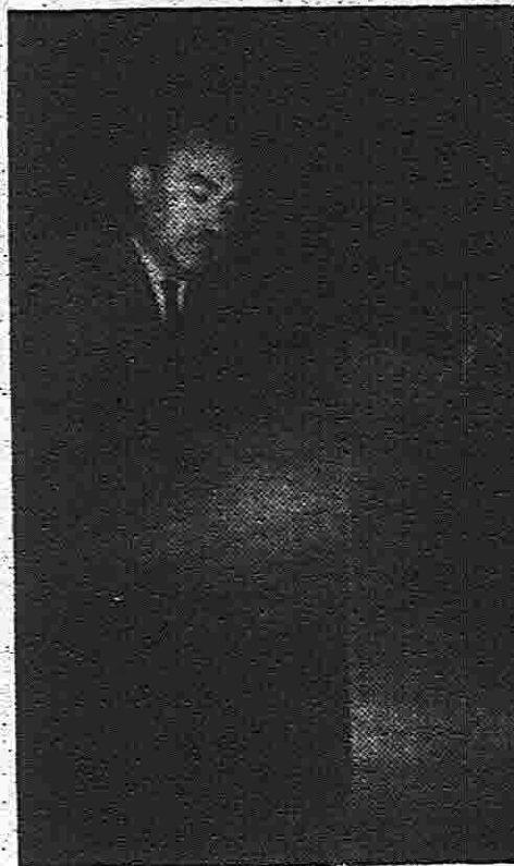
Prime Minister Dr. Mohammad Yousuf delivering his speech during the opening of Radio Afghanistan Studios last night.