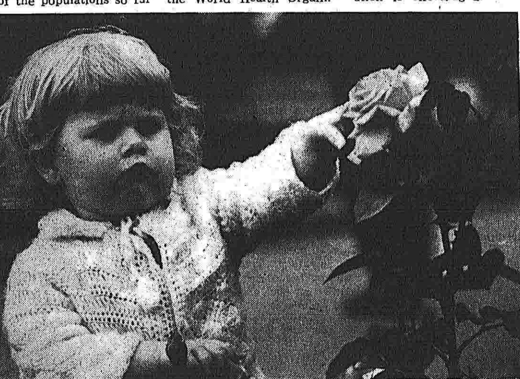
Donetsk today is one of the most beautiful cities of the USSR; its population numbering nearly one million which equals to the number of the rose bushes.

Realizing the importance of water and sanitation for children and their families, UNICEF increasingly assists the governments of the developing countries by providing supplies of materials and equipment, funds for training of national staff and some supporting personnel, both expatriate and local for training and logistics. In all of these projects, UNICEF co-operates with the World Health Organization.