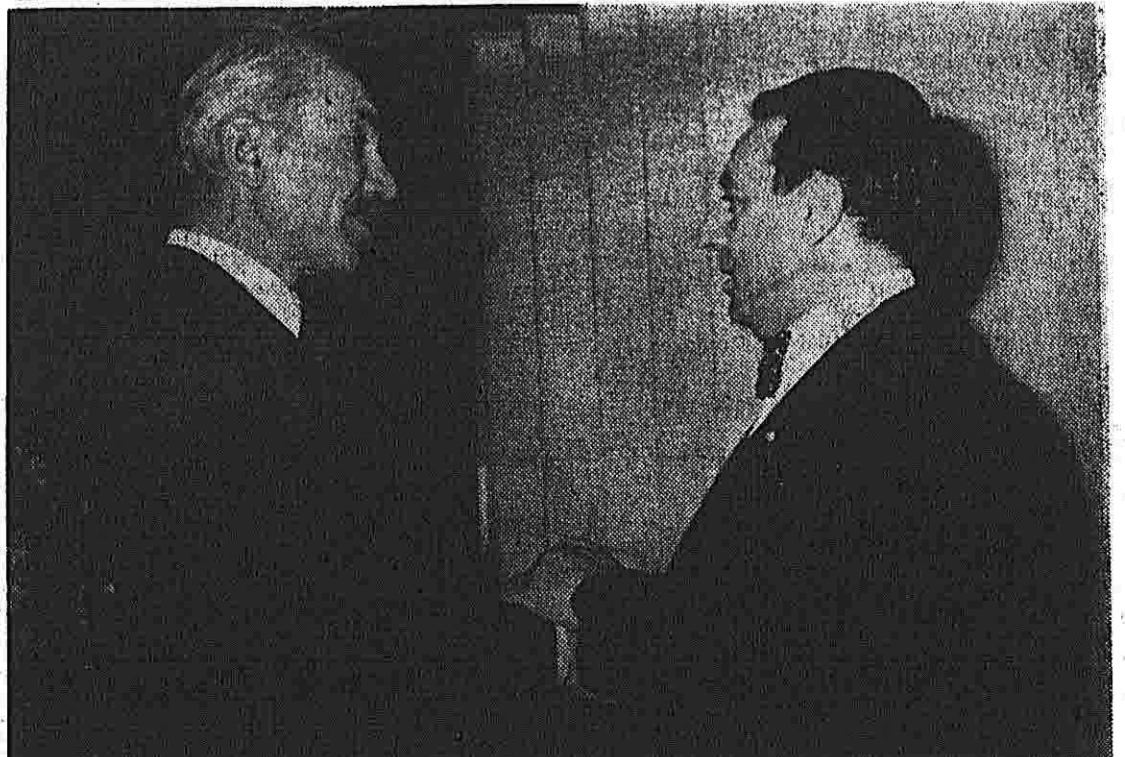
First Deputy Minister for Political Affairs congratulating the Ambassador of Italy on the occasion of National Day of that country.

At the end it was decided that the Ministry of Defence of Afghanistan send a total sum of afs. 20,000,000 from its budget to the Ministry of Agriculture and Land Reforms to meet the expenses of the building of Darul-Aman Sericultural Project.