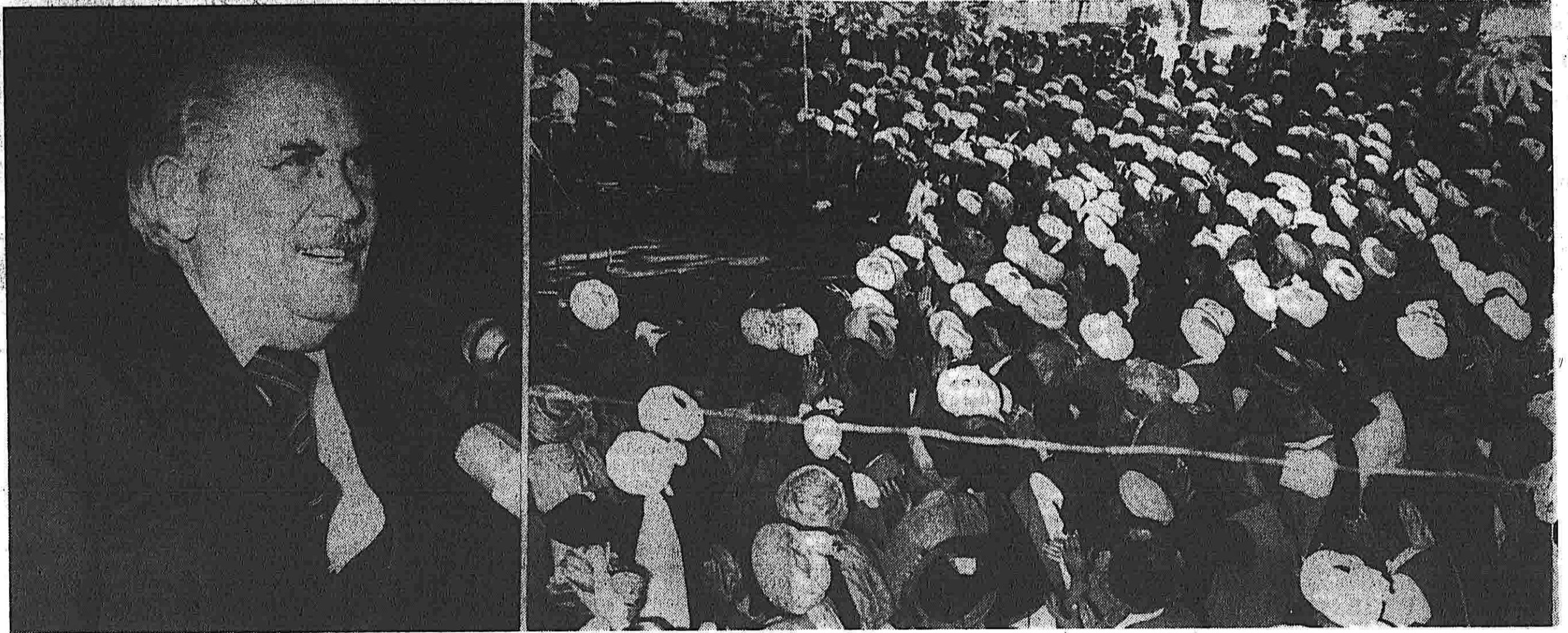
Great Leader of the People of Afghanistan Noor Mohammad Taraki, General Secretary of the PDPA CC, and President of the Revolutionary Council talking to a number of noble people and representatives of Pakthia, Ghazni, and Badakhshan provinces at the People's House.

KABUL, June 4, (Bakhtar).— The great and beloved leader of the people of Afghanistan, Noor Mohammad Taraki, General Secretary of the Central Committee of PDPA and President of the Revolutionary Council of DRA received a number of chieftains, and elders of Pakthia, Badakhshan, and Ghazni provinces and Loi Woleswali of Khost at the People's House yesterday and in an atmosphere full of sincerity benefited them from his valuable directives.