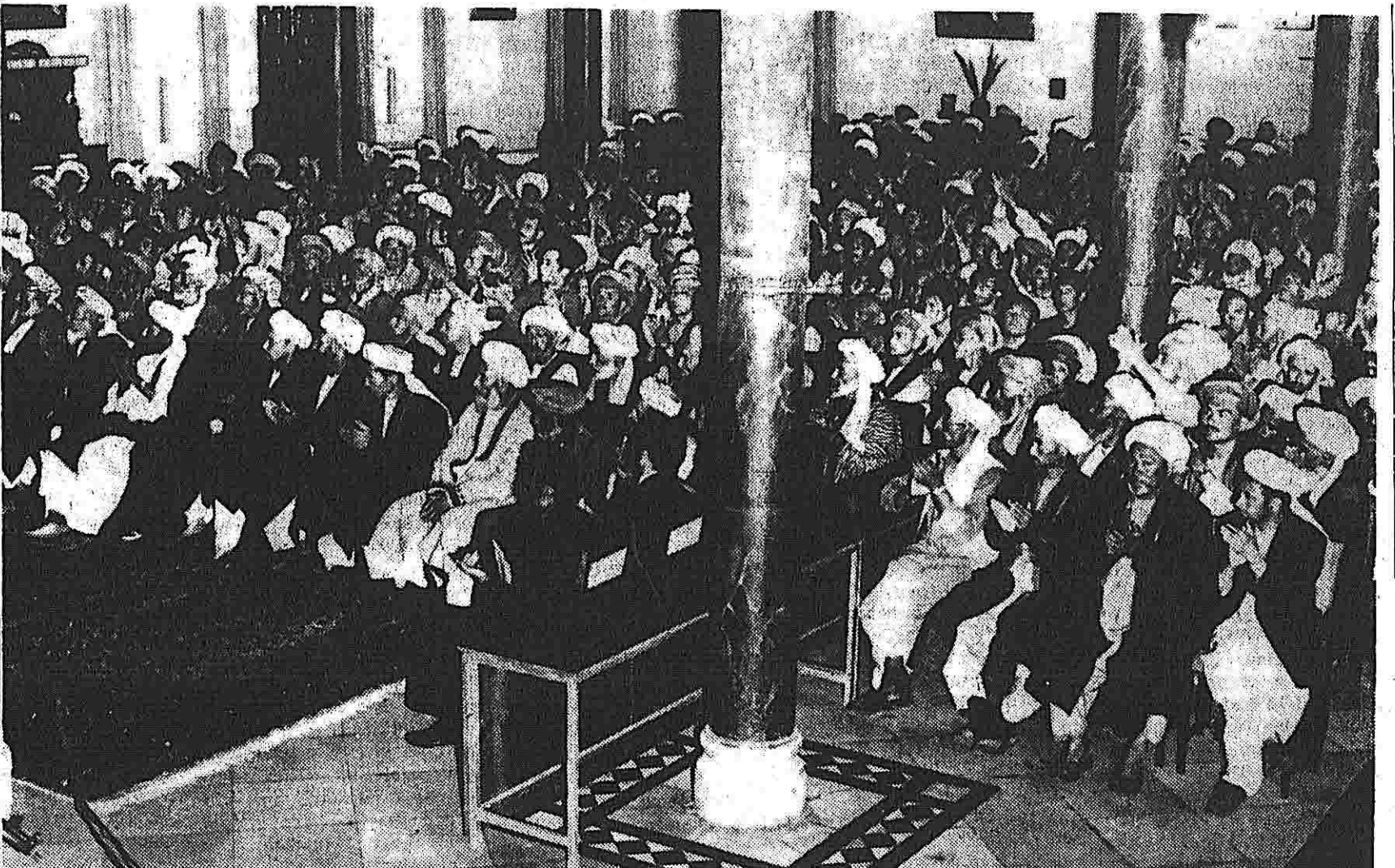
Hafizullah Amin, Secretary and Member of the PDPA CC, and First Minister talking to representatives and noble people of centre and woleswalis of Jauzjan and Kunar provinces.