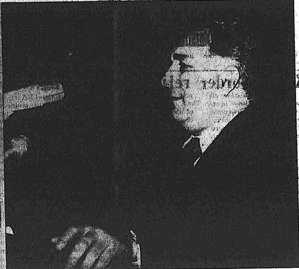
Hafizullah Amin, Secretary and Member of Politburo of the PDPA CC and First Minister addressing representatives and noble people of Maidan at the Stor Palace of Ministry of Foreign Affairs.