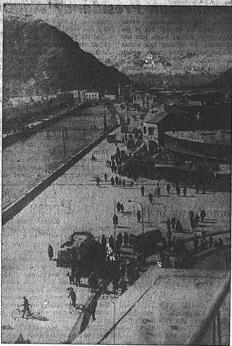
Taken from the top of a building near the Spinzar Hotel, the picture shows the Kabul River, which is full of water at this season.

Towards the right side of the photo new buildings are coming up. They will shield the slum area at behind which Kabul municipality plans to demolish soon.