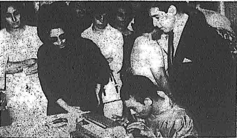
Health Minister Kubra Nourzal inspects a blind person practicing typing.

He added that the Ministry of Public Health has signed an agreement with the Noor Society for the Blind which will hold courses here in the near future and which will supply the Ministry with teachers.