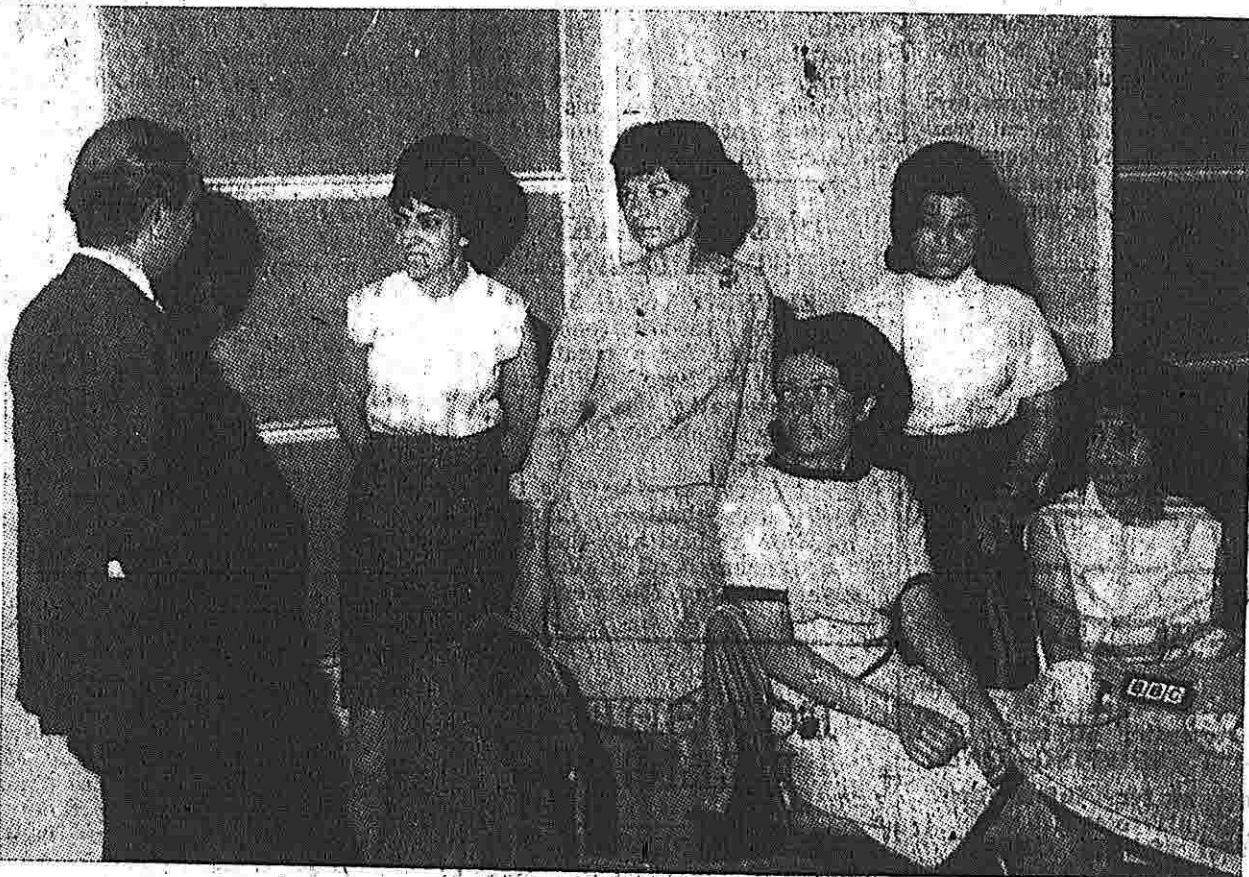
Five student nurses from Afghanistan recently visited the BBC studios in London to record a programme in Dari for Radio Afghanistan's series "Our Children Abroad".

Now the computer, owned by the city council, does all the administrative routine: picking out the names at the right time, making the appointments, and even noting defaulters for a health visitor to call upon. All the family doctor has to do is the actual immunising and tick a name off the list.