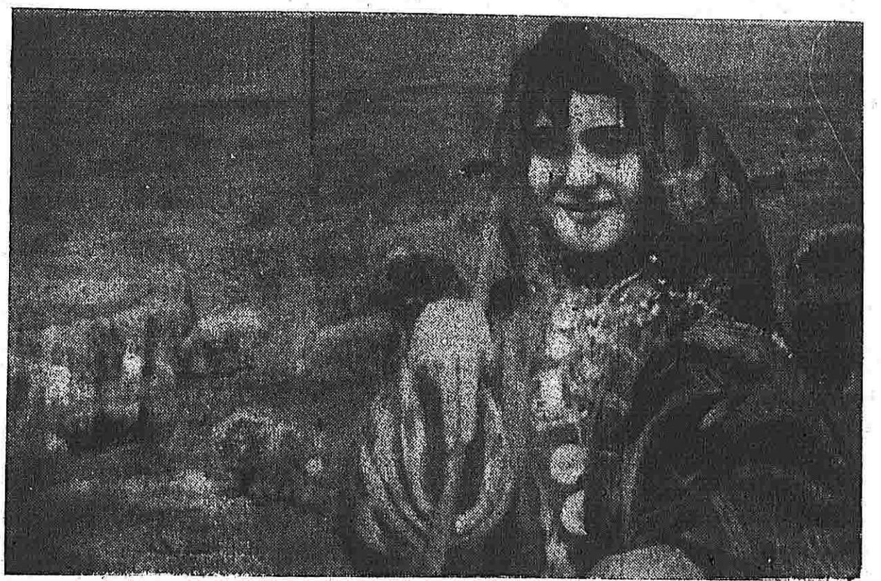
This painting of an Afghan shepherd girl is one of the more than 180 works displayed in the winter saloon, on the first floor of the Ministry of Information and Culture, next to the Splnzar Hotel. The exhibition, which can be visited from 9 to 2 p.m., will be open for another week.