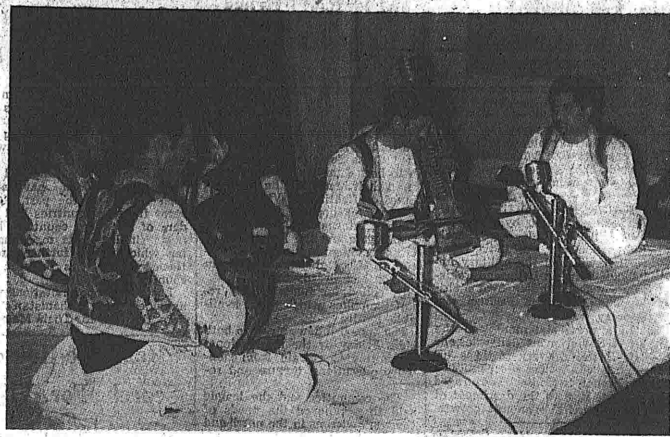
A 12 member delegation of Afghan artists returned to Kabul last week after a 23 day concert tour of India.

In former times the predominant form of the art was the so-