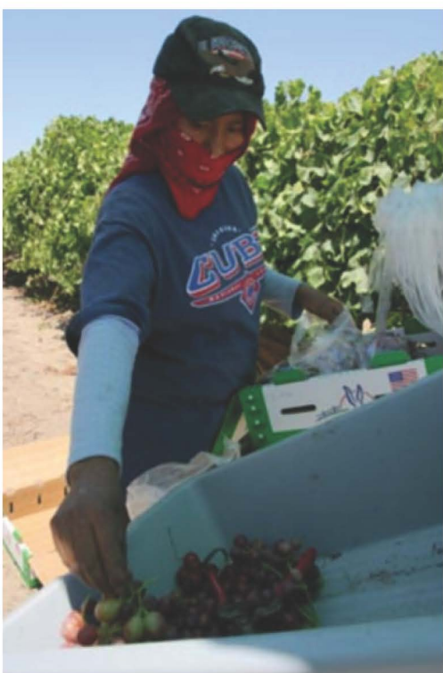
Migrant worker in Coachella Valley prepares grapes.