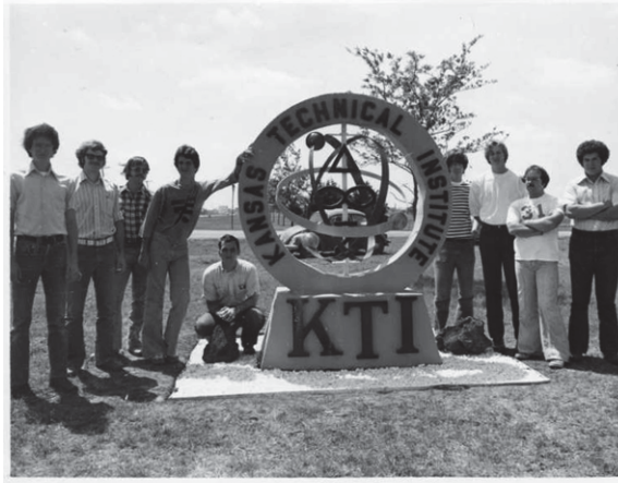
Who-dat? Help us label our archive pictures! What year was this put up on campus? Who are the guys next to it?

Once the overall task of inventorying the collection has been completed, the library will take the next step in displaying the photos in various locations. Although the collection may never be fully cataloged and labeled, the library feels it has a duty to share these artifacts with the community. The first location will be in the library's large display case near the entryway so that during the library's Open House visitors can view a sampling of the collection as they walk through the doors. Genealogists and local patrons will also have the option of learning about the collection while they use the Campbell Room for local archival records by viewing the display case located directly in front of the collection at the Salina Public Library. The Smoky Hills Museum would provide a similar opportunity if the library chose to display a sample of the collection so visitors could learn about the metamorphosis the school has gone through in the last fifty years and how it has influenced the region.