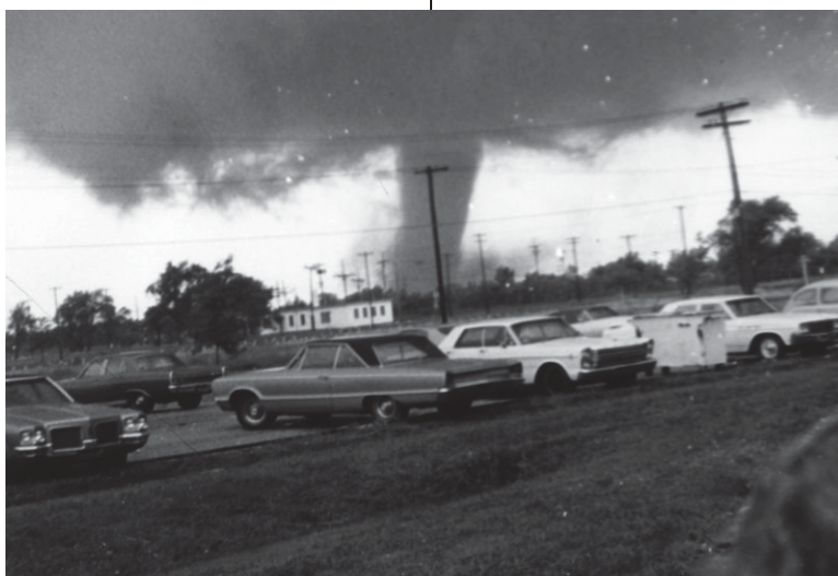
Who-dat? Help us label our archive pictures! Anybody recognize the year or cars in this picture with the tornado?

subjects in the photo, as well as the date, location, and event type documented. The accepted materials must be associated with K-State at Salina campus activities and/or previous activities occurring on the campus under the aforementioned K-State identities.