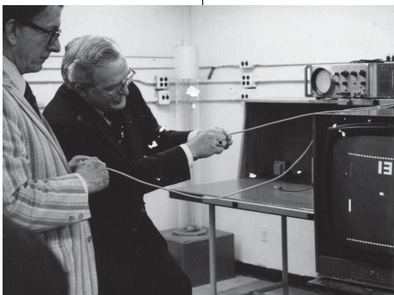
Who-dat? Help us label our archive pictures! Oh MY – it looks like they're play Pong! Remember that? Who's playing?

identified. For example, if the picture contained a lecturer and an audience, the speaker's name, the occasion he or she was speaking at, the place and the date would be recorded. Multiple pairs of white cotton gloves were ordered as well to protect the integrity of the materials during the sorting until they found a permanent home in the cabinets, as well as for handling the materials while