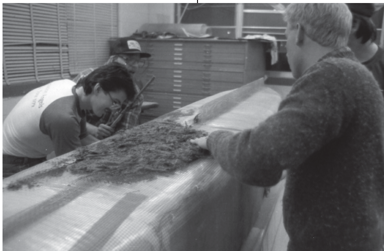
Who-dat? Help us label our archive pictures! 1987 Concrete Canoe Event Who are the guys smoothing concrete over the frame?

their use. Presently, few people on campus are even aware the library possesses this superb collection, and it could prove to be extremely helpful for historians doing research about Kansas State University at Salina, the surrounding community, or the state of Kansas.