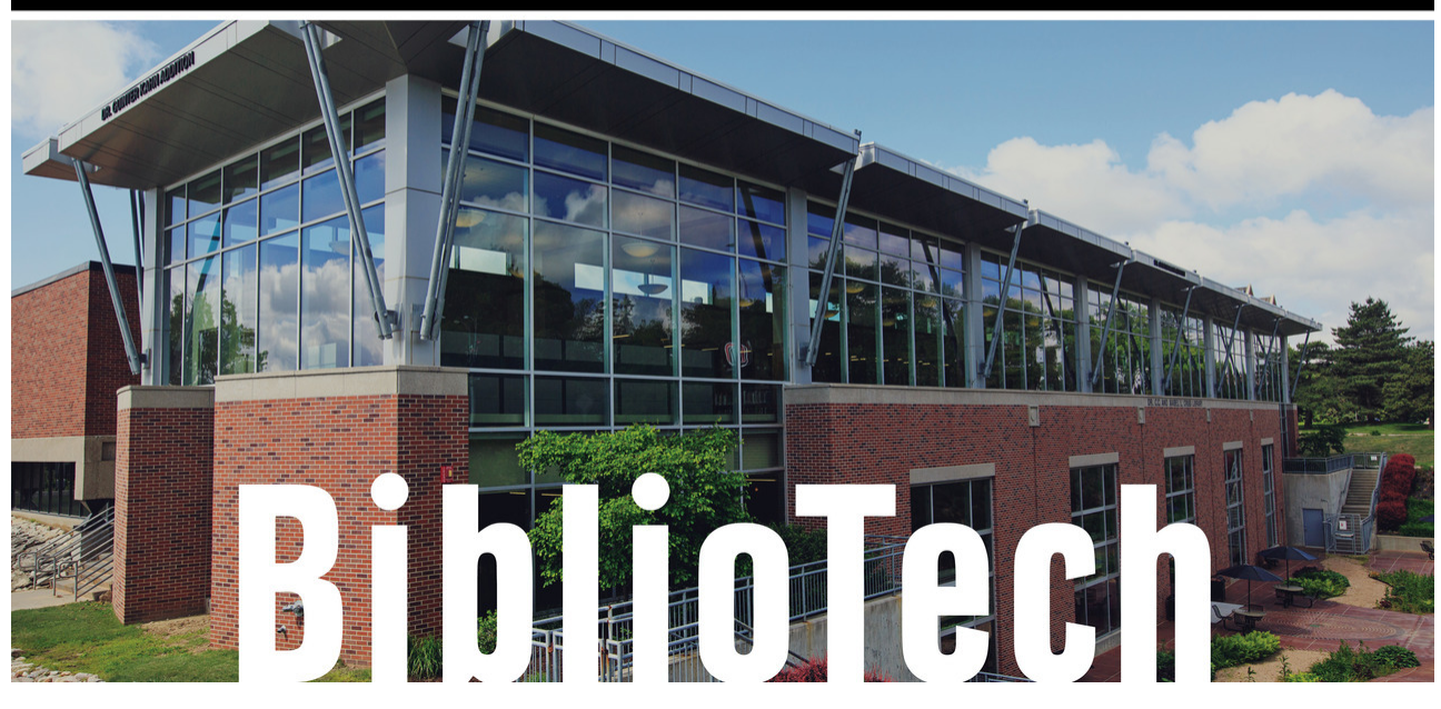
UNO Libraries' Digital Newsletter | January 2021

Creative Production Lab Spring Services Update