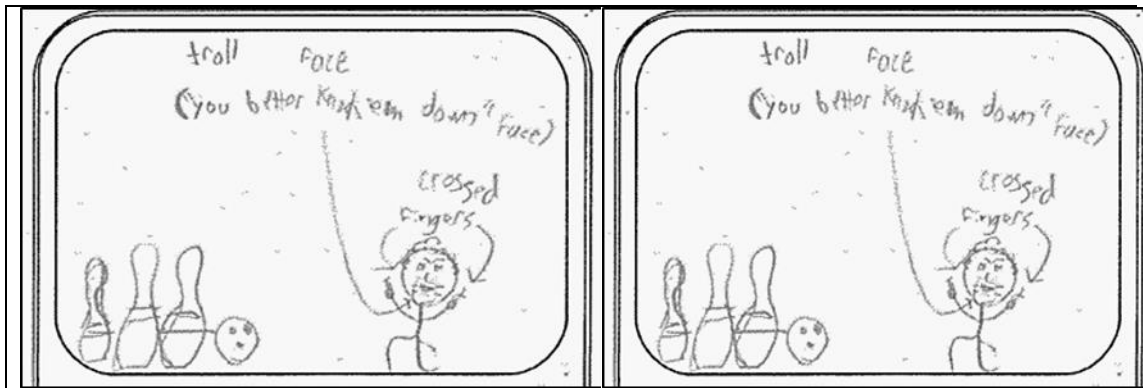
Figure 1. Student perception drawing

did was the card race with shooting a hoop. I liked it because it's better than worksheets, and we can have fun and be active at the same time as learning stuff" (Figure 1). Another student reported, "My favorite game is the [Basketball] shooting game. It's fun for me because you can learn more fractions and be smarter when you grow up. It also gets your brain working on math. That's the reason why I like the [basketball] shooting [game]. Interestingly, the students in the comparison classroom also noted their favorite activities involved any time they were active in their classroom. As a reward for good behavior, the comparison students were able to do fraction bowling on the final day of the unit. Of the comparison students 53% reported this was their favorite activity of the mathematics unit. As one student wrote, "My favorite part of fractions is when we went bowling in the classroom. I liked it because it's not like ordinary bowling. We had to write down the fraction that we knocked over" (Figure 2).