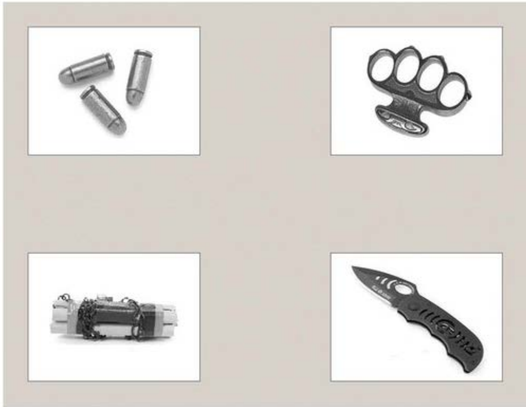
Figure 3. Example Slide Used in the Automated Screening

After the screening, each participant completed a brief survey designed to check experimental manipulations and to collect information on his or her experience during the interview.