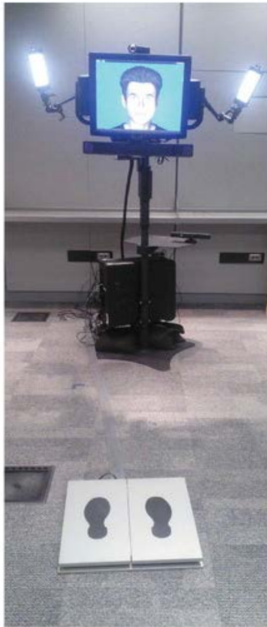
Figure 2. Automated Screening Kiosk Used to Question Participants