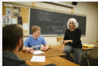
English & Writing

A comprehensive college education provides you with knowledge that should enrich your life and prepare you to face the challenges of living and learning in an ever-changing world.