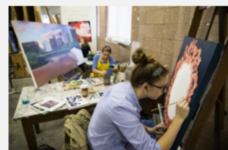
Humanities & Fine Arts