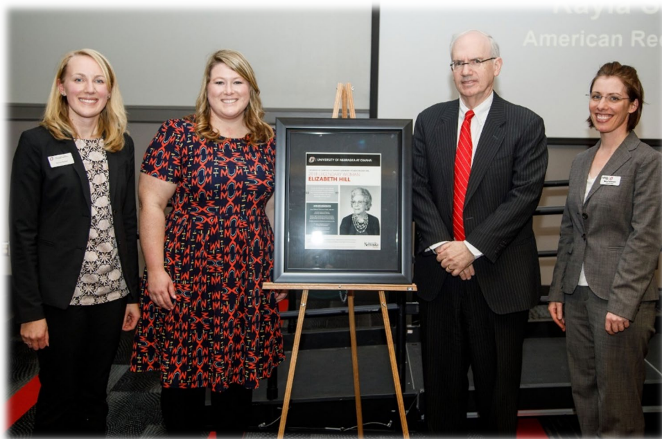
CCSW co-chairs with UNO Chancellor Gold (2018 CCSW luncheon)