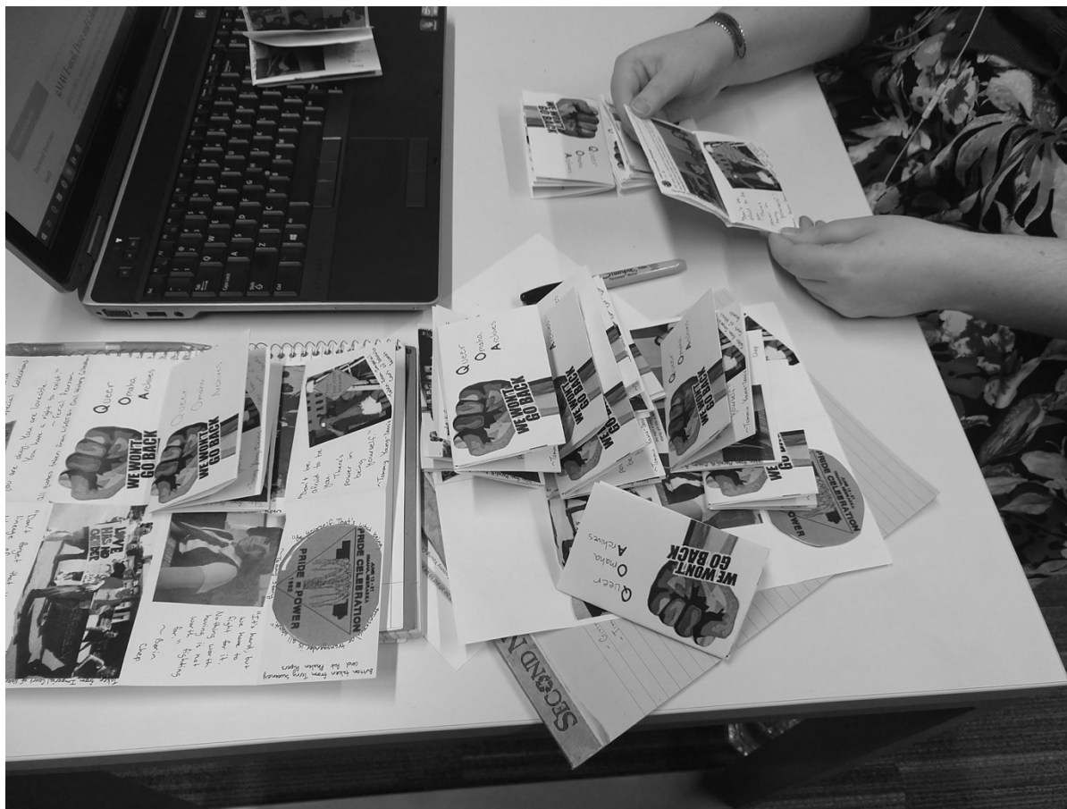
Figure 2: Archives and Special Collections' practicum student, who chose the moniker "KJ," creating a zine about UNO Libraries' Queer Omaha Archives.