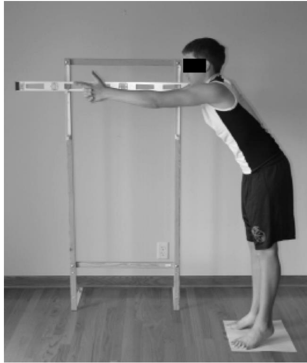
Fig. 2. Two-arm functional reach test (example of heels-up position).

that the best scores were distributed among the 3 trials. In addition to the 1-arm and 2-arm reach, an alternate method of calculating the FRT score was explored by measuring from toes-to-finger. This score was calculated from the final reach measurement obtained in the finger-to-finger method without additional trials. The method was applied to the 1-arm and the 2-arm reach tests resulting in a total of 4 measurements in the analysis.