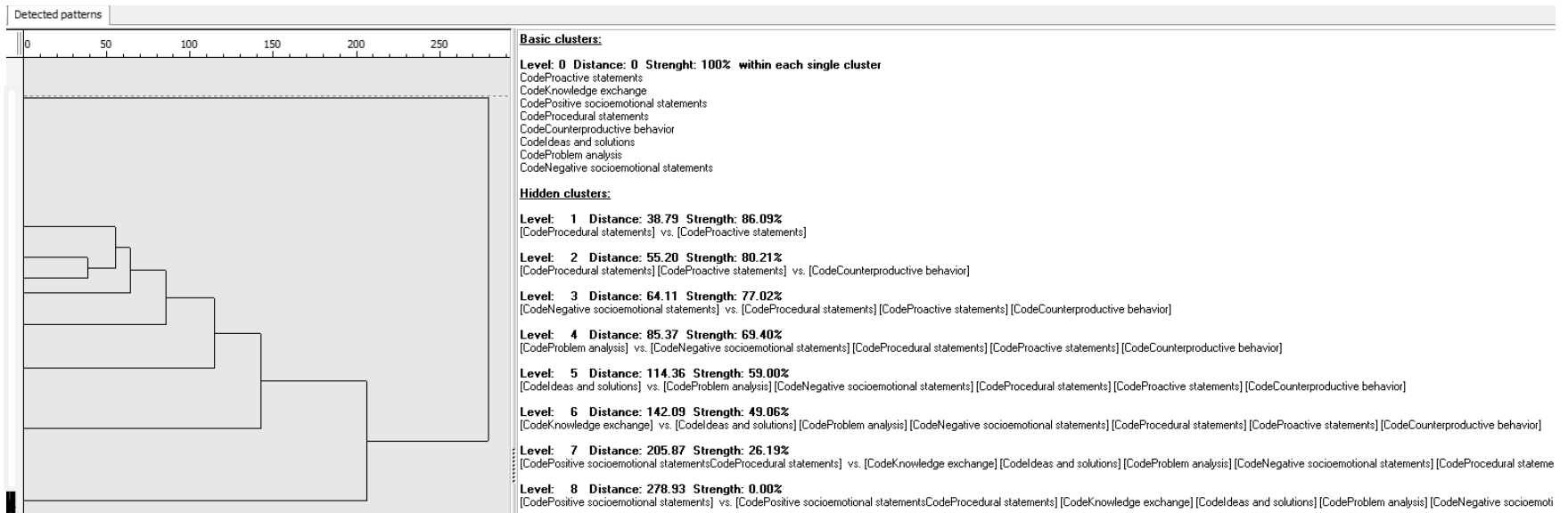
Figure 3. Pattern analysis for one sample team meeting, generated with INTERACT software.