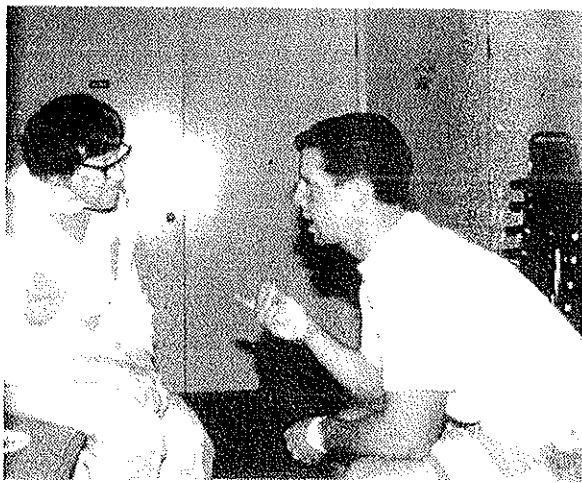
Other college students may work with the elderly and homeless.

The inauguration of an on-campus student community service office can overcome many of these barriers. It will need paid staff to ensure continuity, and a number of computer stations around campus at which students can give evidence of their interests. The community service office will, in a sense, become a "talent bank" to which the community can turn for assistance. At Stanford University, the Public Service Center is now a well-known landmark for students to pursue volunteering sugges-