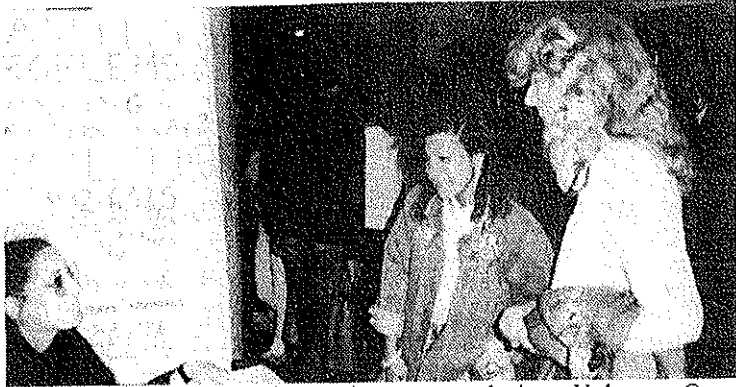
Students learn about a community service program during a Volunteer Opportunities Fair; these fairs are held on campuses throughout California.

from the top administration of each campus and collegiate system. The leadership must be clear and public. There can be no equivocation in speech or written documents. California Compact, an association of university presidents, soon will be vigorous in this regard. Academic deans, deans of student affairs, deans of residential life and members of faculty senates must come together to weigh the questions of credit, educational content, internships/volunteers, work-study and record-keeping. Currently in California, some campuses view the Human Corps as an expanded intern program, while others wonder if there is any learning to be gained by going off campus. Campus Outreach Opportunities League (COOL), an intercollegiate student organization with members from 300 different campuses, is educating students to the rewards of community service and urging them to become involved with Human Corps planning on their campuses.