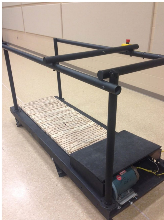
Figure 2. In-house built uneven terrain treadmill. Wooden slats, manually shaped to form a repeating pattern, were affixed to a standard treadmill belt. The pattern has four levels, with increments of approximately 7 mm, 7 mm and 8 mm.

of mass 31 . The second accounts for the influence of the mass and motion of the segment about a fixed point of reference 31 ; in this case, the whole-body COM. About each axis, L was quantified through the summation of the two components of angular momenta of all of the segments, according to Eq. (1) 10,31 :