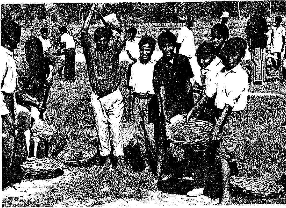
City Montessori students gain practical skills by participating in local projects.

universal values of the world's great religions. All religions, for example, have their own version of the Golden Rule (fig. 1), and all teach kindness, honesty, and responsibility.