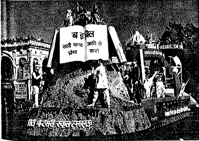
Several delegations of children visit the International Summer Village Camp each year (top photo). Bottom photo, "Unity of Religions" was the theme for the Republic Day parade.

and state-level high school board exams. (On the last state exam, 7 of the top 21 scorers were City Montessori School students.) In addition, 99 percent of students maintain an average grade of A and all graduate from high school, as compared to 30 percent in the state overall.