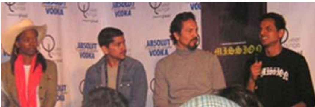
Thanks to the Queer Lounge for hosting a panel discussion of La Mission that included Benjamin and Peter Bratt along with other actors from the film.