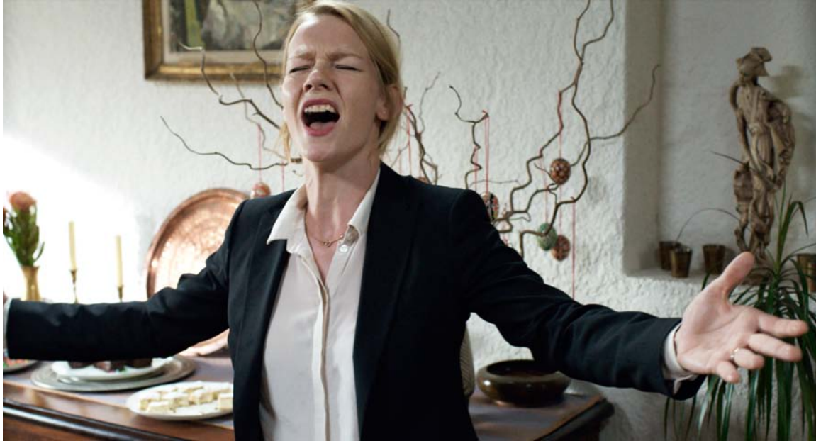
Ines in Toni Erdmann brings people together with "The Greatest Love of All."