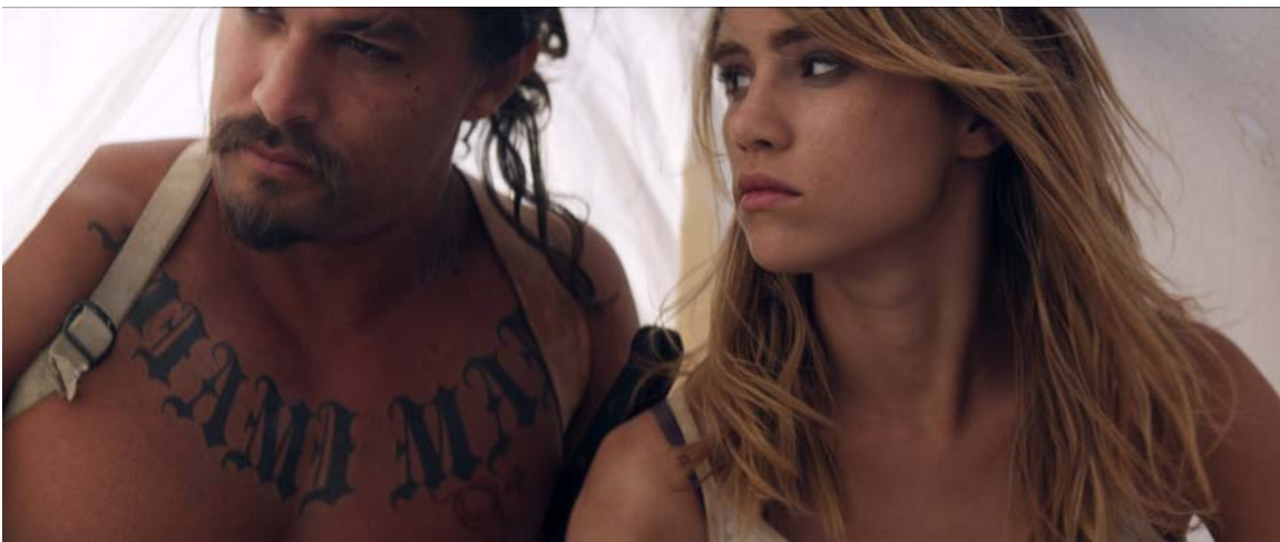
Falling in love with a cannibal in The Bad Batch .

want to be. Self-preservation is the literal theme of The Bad Batch , a Grindhouse horror-comedy-romance that has been described as a “cannibal fairy tale.” 8 The film centers on Arlen, who escapes a dystopic community dominated by several men ( after two of her limbs have been eaten) only to find herself being asked to submit in other ways to a community dominated by one man. The title of Toni Erdmann refers to a wonderfully ridiculous persona that the male protagonist, Winfried, adopts in an attempt to find some connection with the female protagonist, his daughter Ines. For her part, Ines has been playing the role of hatchet consultant in a patriarchal corporate environment for so long, recommending that companies cut staff in order to maximize their profits, that she appears to have forgotten who else she might be. Gloria in the uniquely imaginative Colossal ends up trapped by a man enraged and emasculated by his own existential impotence, forced to soothe and placate him until she finds the resources to fight back and reclaim her life. And in Arrival , linguist Dr. Louise Banks finds herself having to constantly, passively, push back against male military aggression in attempting the overwhelmingly complex task of trying to understand actual space aliens.