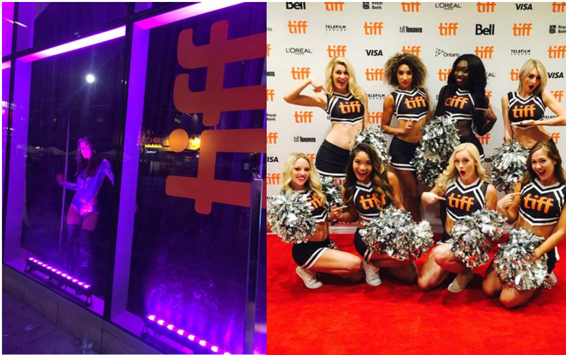
Opening and closing TIFF events.

for TIFF, the female filmmakers and industry guests and the general public when they walk into an official TIFF event to see women treated as objects?” 6