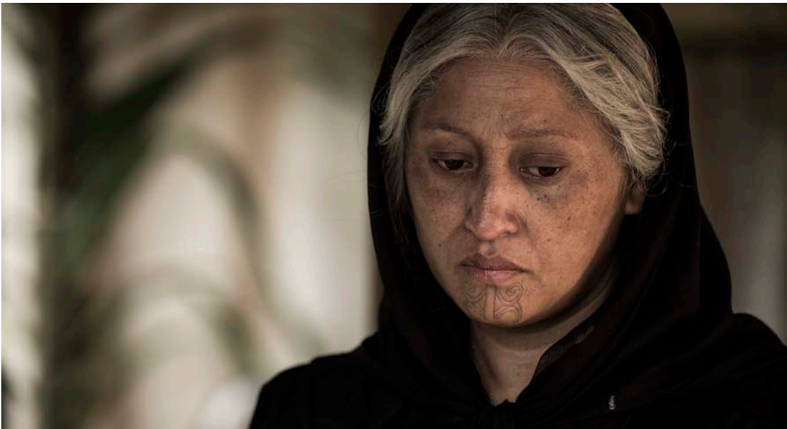
The matriarch in The Patriarch .

Gender was also very much a concern in the seven fictional films that I saw. Women had critical roles in the three Indigenous features ( Goldstone , Maliglutit , The Patriarch ), and were protagonists in the other four ( Arrival , The Bad Batch , Colossal , Toni Erdmann ). The film whose title most explicitly raises the issue of gender is of course The Patriarch , which not only presents the problems of the patriarch(y) but the contrasting strength and wisdom of the matriarch. Goldstone also features a powerful matriarch, but in this case one whose stereotypically “feminine” characteristics – nurturing, baking pies – hide her true, patriarchal, nature: she is selfish, violent, and cold-hearted, more than willing to engage in trafficking women to attain her goals. Maliglutit , an Inuk remake of John Ford’s The Searchers , is similarly about men taking women from their homes, and the ways in which such actions destabilize a community.