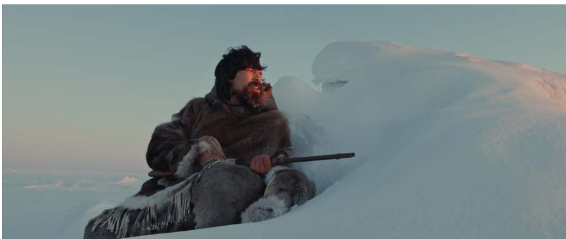
Kuanana searches in Maliglutit .

There were many movies at TIFF this year about specific religions. Most of the films I selected, however, turned out to contain just a few explicitly religious references, typically to Christianity: some Protestant funerals ( Goldstone , The Patriarch , Toni Erdmann ); the occasional biblical name (Hannah in Arrival , Joshua in both Goldstone and The Patriarch ); one Easter egg decorating scene ( Toni Erdmann ); and the brief mention of a “Pentecostal cult” ( Arrival ). On the other hand, the three Indigenous films ( Goldstone , Maliglutit , The Patriarch ) include significant details from Australian Aboriginal, Inuk, and Maori traditions. These films do an excellent job of showing a range of Indigenous identities and experiences, and how these are tied to religion. They also highlight the common importance of place in Indigenous traditions and communities, and the common value put on treating both people and the world in which we live with care and respect. Finally, each of these films presents Indigenous traditions in modern contexts, making the point that while they have changed since contact with Europeans, they are still very much vital and alive. In Maliglutit , for example, Kuanana sets out with his son to rescue his wife and daughter from the men who took them. In his quest he is aided both by his rifle and by his father's spirit helper, the loon Kallulik.