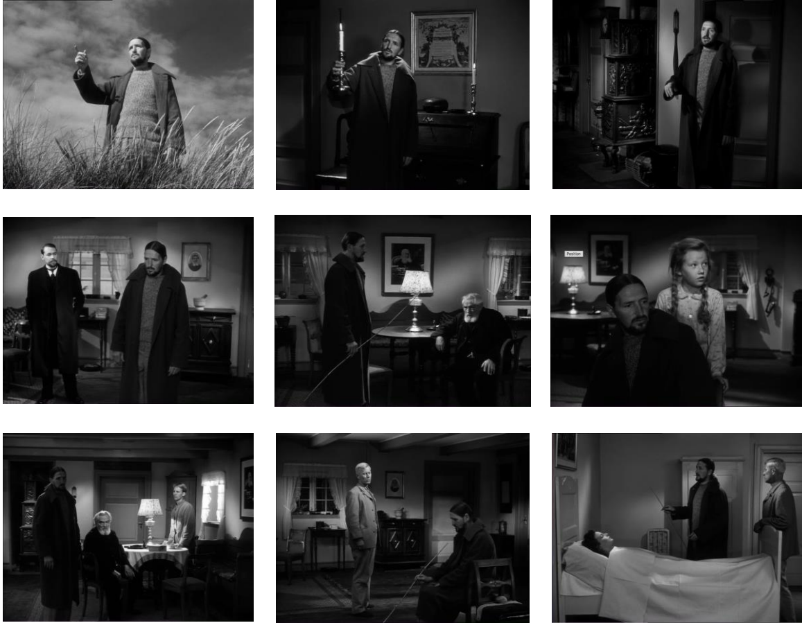
Figure 2 Johannes is dimly lit in all except the first of Johannes's nine scenes prior to the finale, a strategy that is especially pronounced when contrasted with how others are lit.