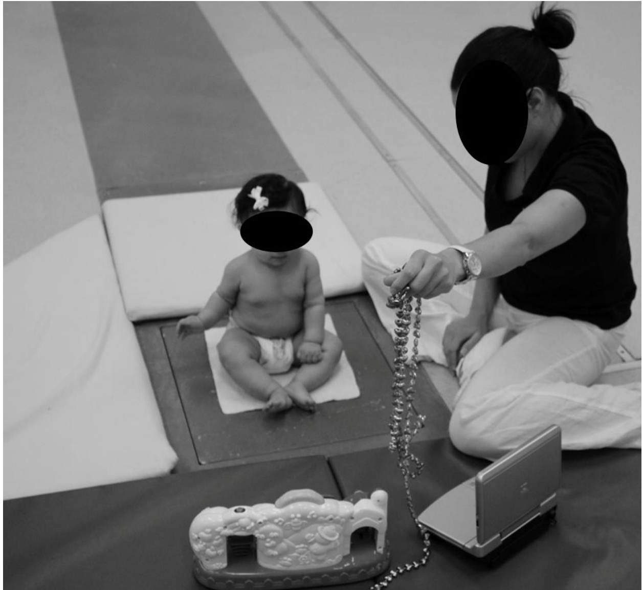
Figure 1. Position of the infant during data collection.